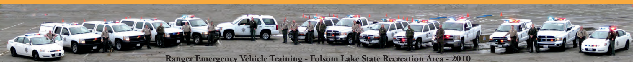
Ranger Emergency Vehicle Training - Folsom Lake State Recreation Area - 2010